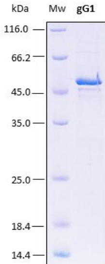
Figure 1. SDS-PAGE analysis (15%) of 7 \mu l of recombinant gG1. Purity is > 95% as determined by gel electrophoresis.